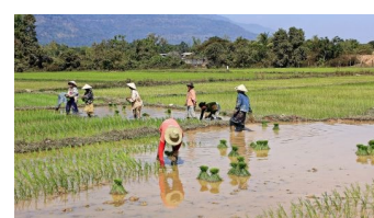
How I learnt to make my voice count at the UN climate negotiations (blog)