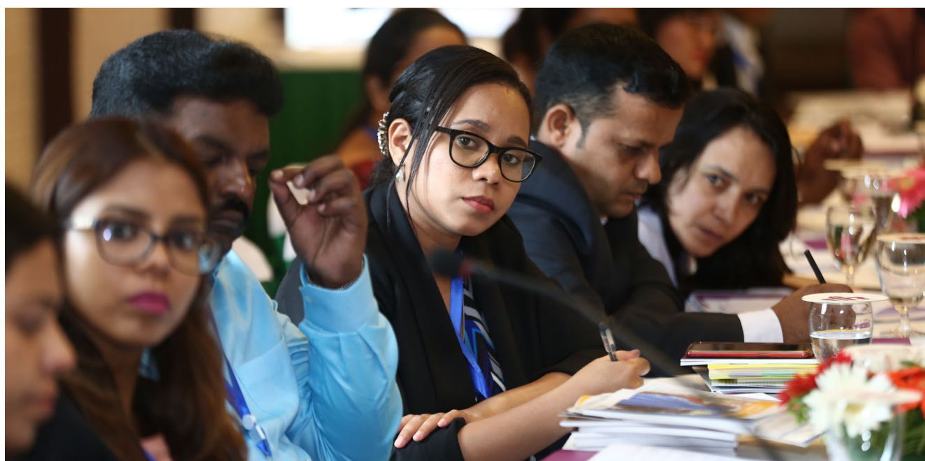
Participants at the ecbi Asia and Pacific regional training workshop, Kathmandu, July 2019