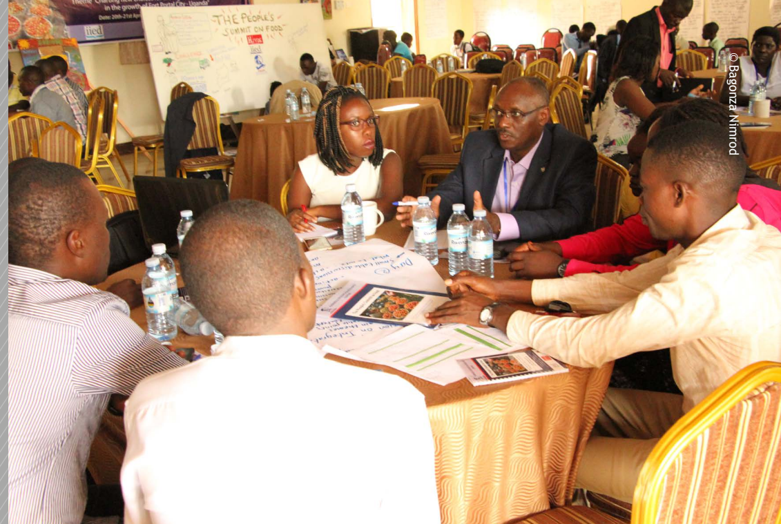
↑ Small group discussions at the People's Summit on Food

The International Institute for Environment and Development (IIED) is a policy and action research organisation. We promote sustainable development to improve livelihoods and protect the environments on which these livelihoods are built. We work with some of the world's most vulnerable people to strengthen their voice in the decision-making arenas that affect them – from village councils to international conventions. www.iied.org