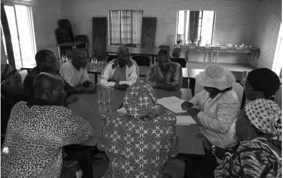
The facilitation group draws up a code of ethics to supplement the BCP.