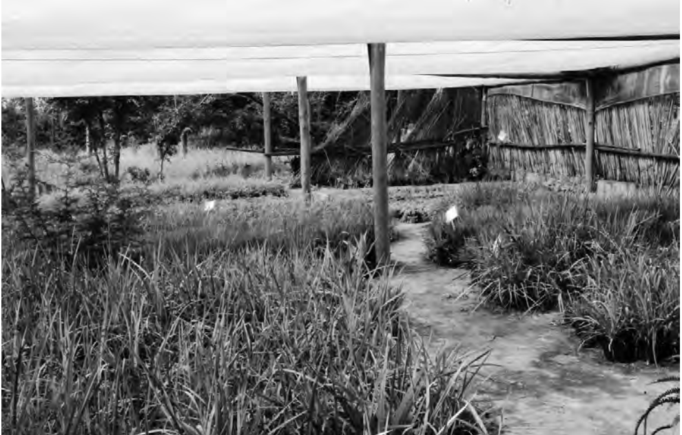
Medicinal plant nursery maintained by Kukula members.

in the east and 300 per square kilometre in the wetter west, the population density is already one of the highest in southern Africa, and the population growth rate is 2.4%. Unemployment in the Bushbuckridge area is estimated at 63%. There is a heavy reliance on the cash economy and on State grants, mainly in the form of pensions and child grants. Approximately 50% of the adult male population and 14% of women engage in migrant labour. The average household income is R850 (about US$110) per month.