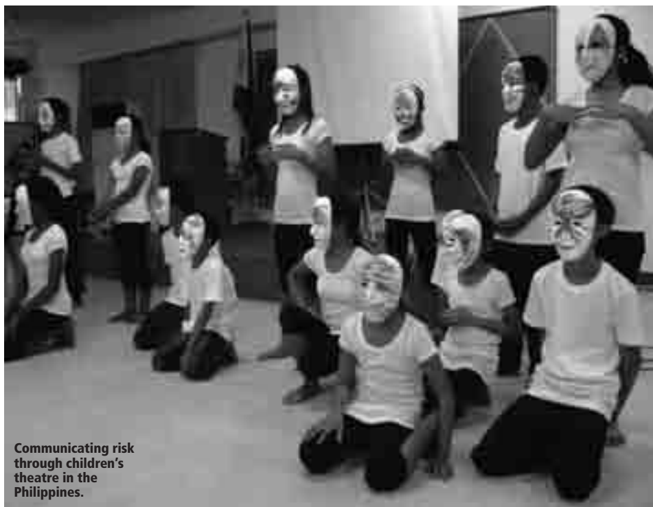
Communicating risk through children's theatre in the Philippines.