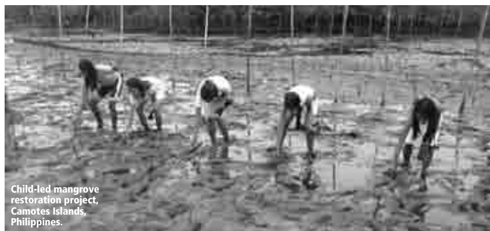
Child-led mangrove restoration project, Camotes Islands, Philippines.