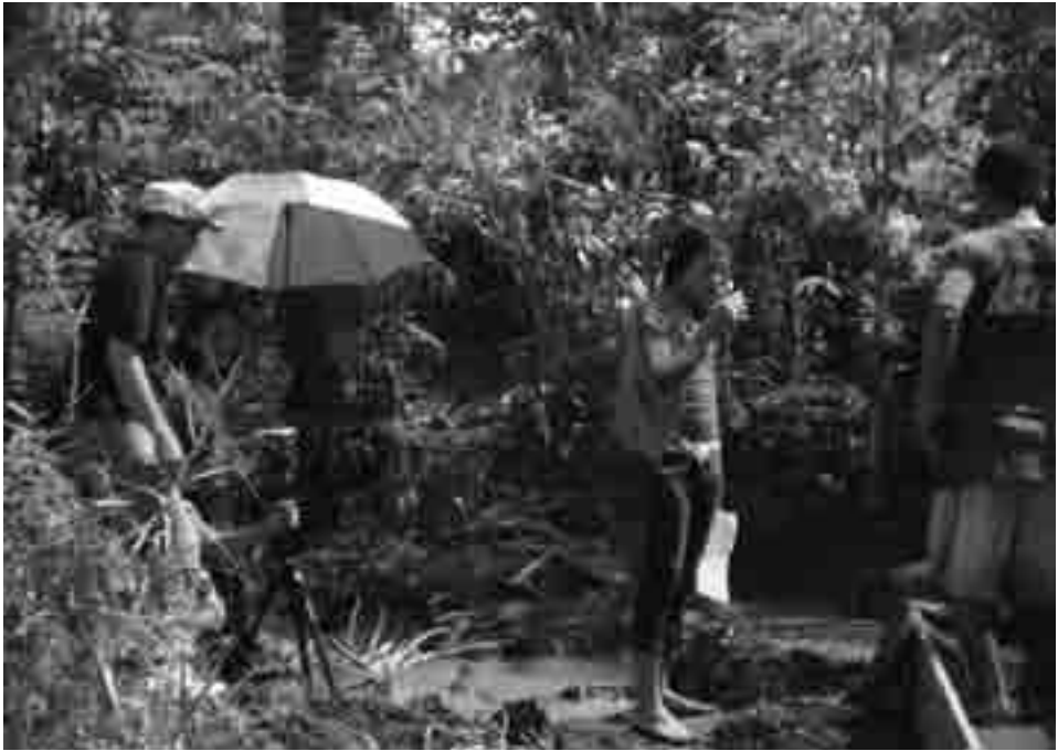
Participatory video shoot on chromite mining activity at Caga-ut, Eastern Samar, Philippines.

Children in the community of Caga-ut in Eastern Samar, the Philippines have been communicating a range of environmental, economic, and social risks posed by chromite mining to a wide audience. Children directly targeted miners, operators, and those licensing the mining, communicating their concerns through meetings and dialogue. Alongside this they have led dialogue with family, resident miners, and community members about the risks posed by the mining activities to present and future generations.