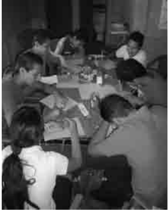
Members of the Youth Emergency Committee in El Ciprés, El Salvador.

Their actions gained the Youth Group strong recognition within the community. They continue to work on community projects, supported by NGOs, and the Community Development Association, which legally represents the community to the mayor's office, has recognised their role and is looking to include them in the future.