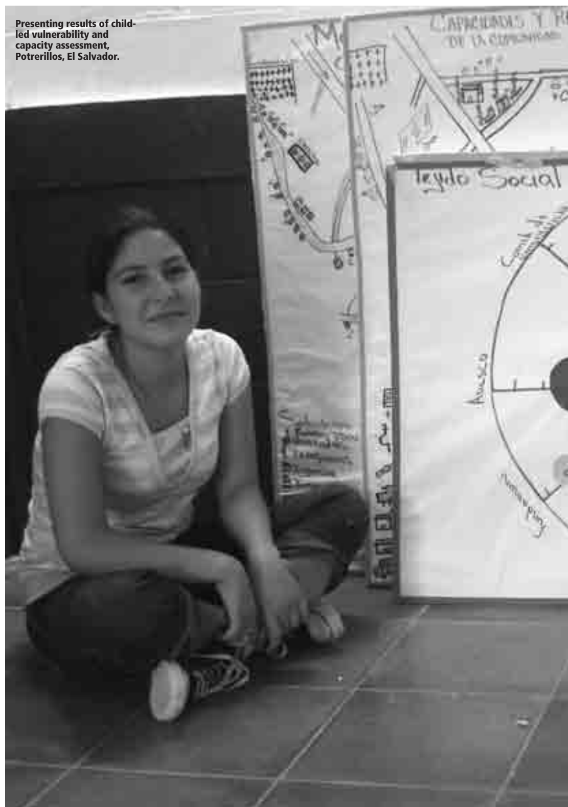
Presenting results of child-led vulnerability and capacity assessment, Potrerillos, El Salvador.