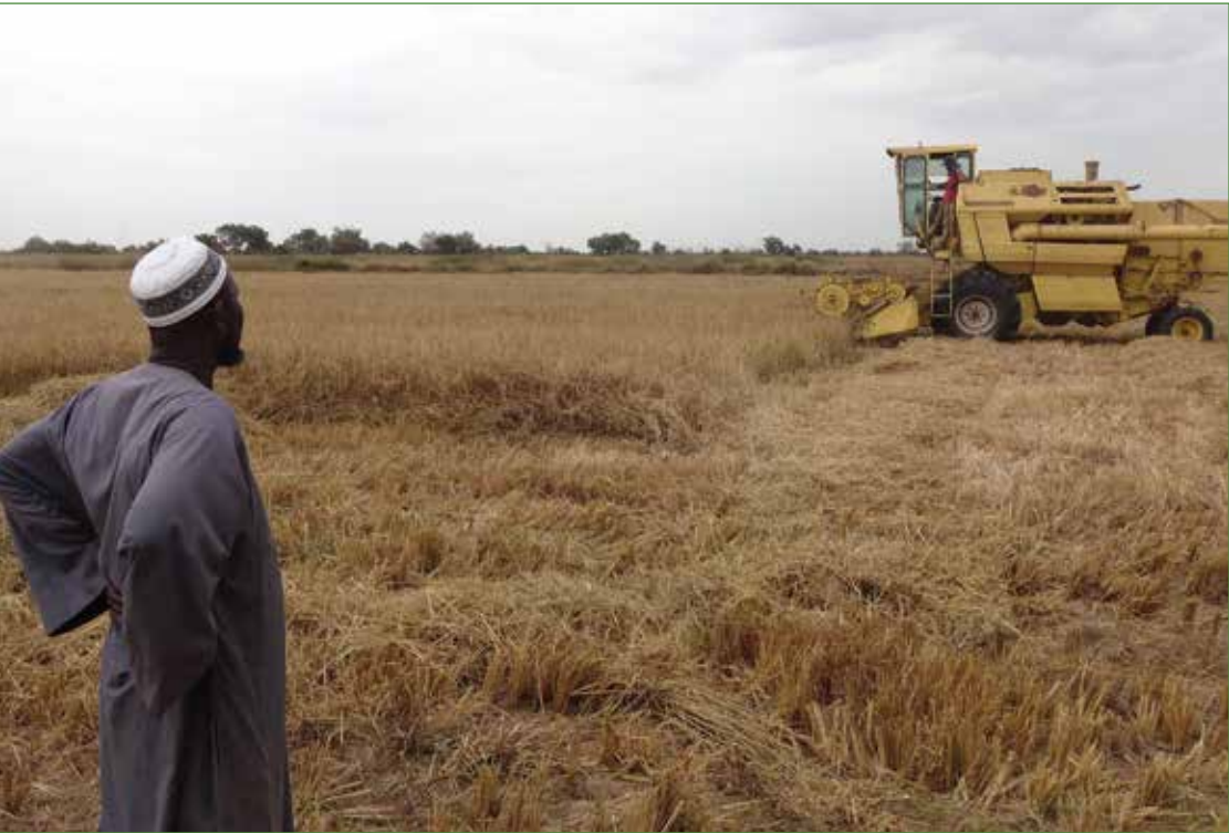
A farmer with combine harvester in his field in the irrigated perimeter of the Niandouba dam in Senegal.

2009, the value of these imports is still over 50 per cent higher than the value of imports before the 2007-2008 food crisis. (WFP/CILSS/FAO/CIRAD/FEWS NET, 2011). In addition, urban consumption of rice accounts for 63 per cent of the rice available in West Africa (Bricas et al. , 2009). Some countries, such as Senegal, have long been importing low price rice (at the expense of rural farmers) to satisfy urban populations who wield strong political influence. The 2007-2008 food crisis might even have had a silver lining because it revealed how this dependence made for a precarious situation and helped put agriculture back at the centre of development priorities.