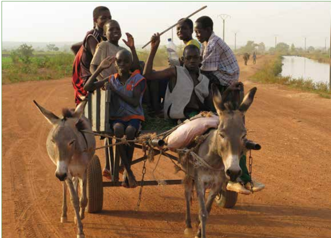
Young villagers in the Sélingué irrigated perimeter in Mali.

Farmers also refer to other important motivating factors, such as sustainable access to land holdings which are becoming increasingly sought after. Many farmers want to hang on to their irrigated plots to maintain a permanent presence in the irrigated perimeter and benefit from a resource which, apart from the opportunities it offers in terms of agricultural production, can temporarily generate income through activities such as renting or sharecropping. These practices are observed most frequently on the poorest farms which, lacking the means to farm their plots, sometimes rent them out.