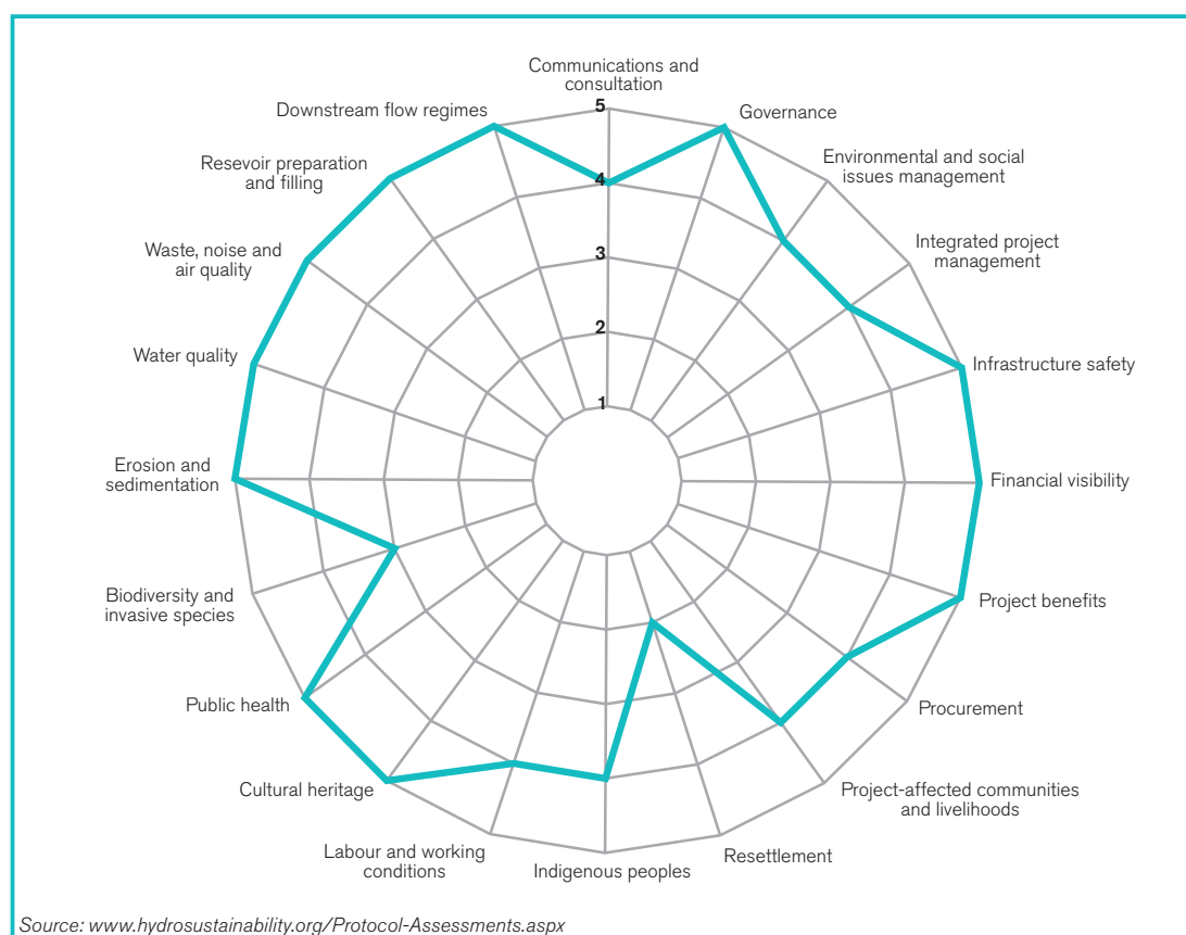
Figure 3. Spider diagram for HSAP Implementation Phase assessment of Brazil's US$8 billion Jirau Hydropower Plant (3,750MW) that is nearing completion at the Ilha do Padre on the Madeira River (Rondonia state) in Brazil.

compliance via a voluntary template, agreed by the EU in 2008, submitted to the designated national authority. 5