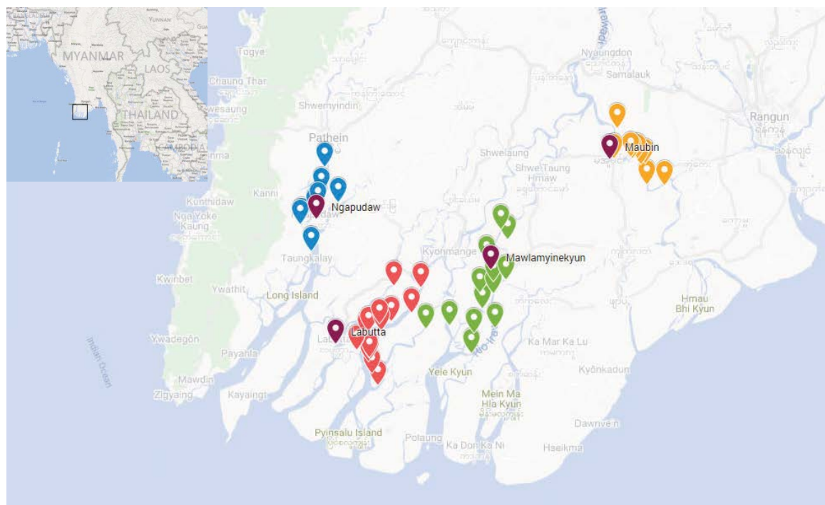
Figure 3. Location of townships and villages surveyed in the Ayeyarwady Delta

Source: https://earthshots.usgs.gov/earthshots/ . The map showing village locations was based on Google Maps