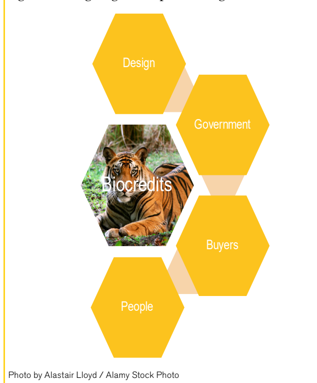
Figure 3. Designing and implementing biocredits