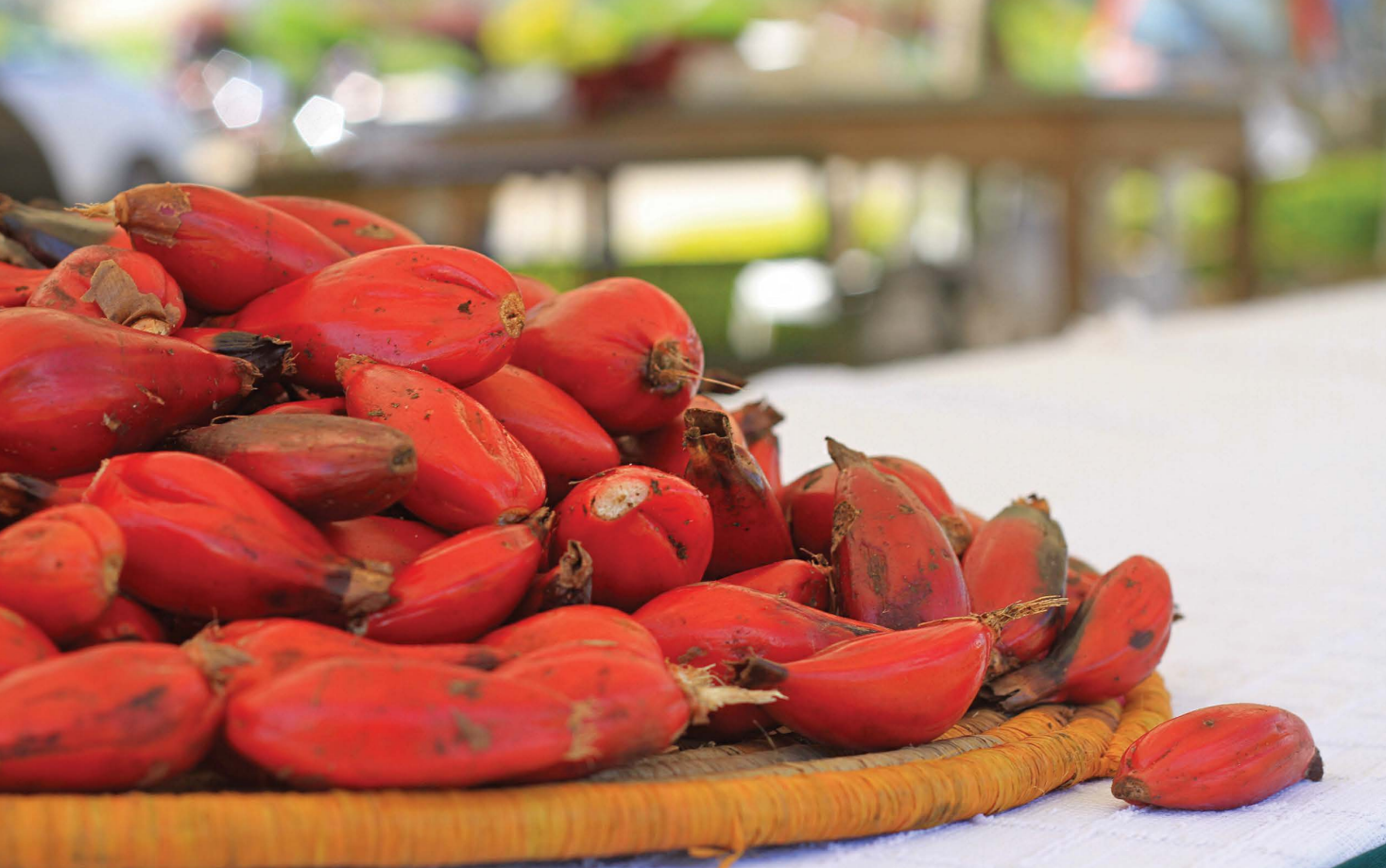
Amatehe. One of the tropical plants that grow on their own. They help to cleanse the digestive system (Joseph Muhumuza)

centres in the region. However, farmers often face barriers to the profitability of agricultural enterprises, including lack of transport, exploitation by middlemen and lack of market information. Partnerships between high-value chain stores (supermarkets) and groceries could give small-scale producers a platform to participate in the highly competitive horticultural business.