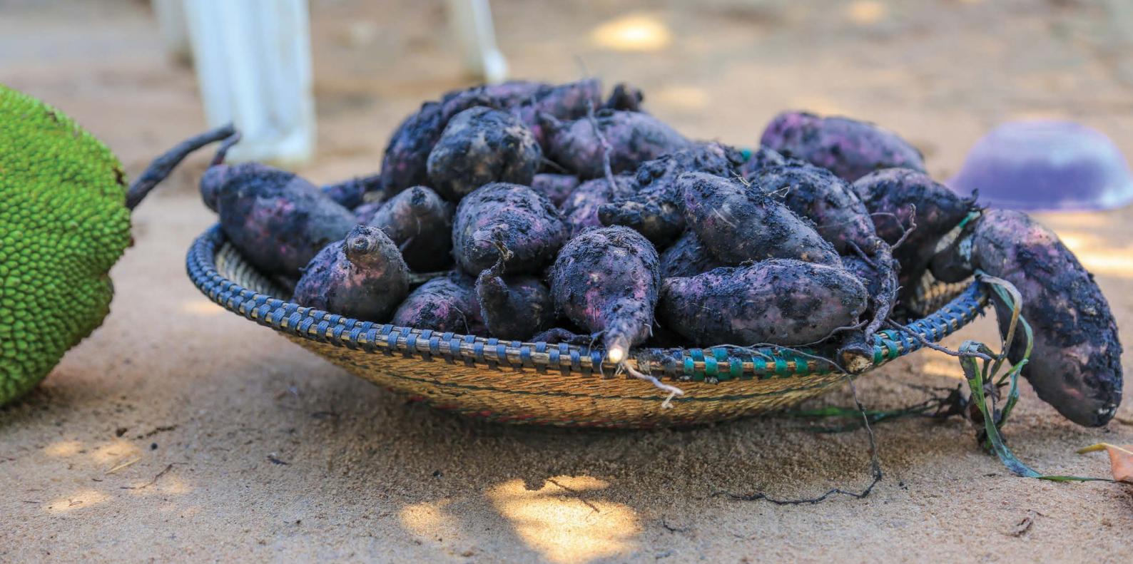
Sweet Potatoes (Layata) (Joseph Muhumuza)

Many non-indigenous rural communities also cultivate indigenous crops and landraces and manage local seed systems, based on traditional and local knowledge. Indigenous people and local communities are custodians of much traditional knowledge on plant genetic resources (PGR), but documentation of this knowledge and inventories of under-exploited plants are poorly developed in Uganda.