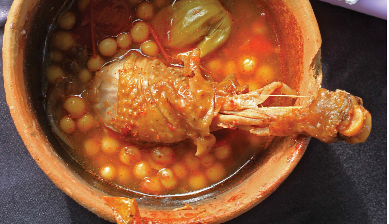
Chicken with cowpeas and egg plants served in a pot (Joseph Muhumuza)