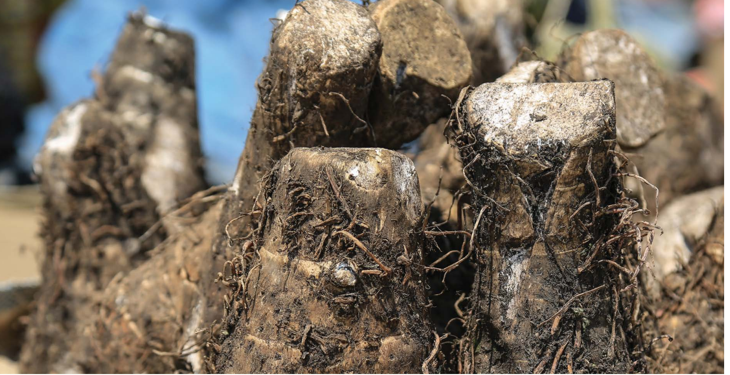
Yams (Joseph Muhumuza)

If cabbage and amaranth leaves are compared, it is evident that amaranth has 3 times more protein and fibre, about 7 times more calcium, 13 times more iron, 4 times more zinc, about 300 times more vitamin A, and 4 times more folate. Comparison of black nightshade and kale leaves shows that black nightshade has 3 times more iron and 6 times more folate. Amaranth also has low phytate level, of 5mg per 100g edible portion. Phytate is a substance that binds minerals and reduces their availability.