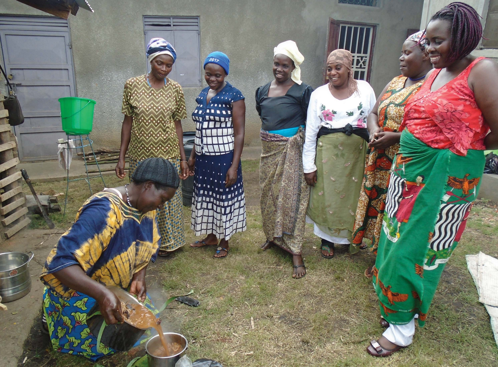
Cookery demos by Orugali women (KRC)

Globally, non-communicable diseases (NCDs) account for 41 million deaths annually, equivalent to 71% of all deaths. In Uganda, NCDs are a public health concern, accounting for 33% of all deaths. For example, in 2016, there were an estimated 97,600 NCD deaths in the country (WHO, 2018). According to the 2014 Ugandan Stepwise survey, about one in four people (24.3%) were regarded as having raised blood pressure. The prevalence of raised fasting glucose including diabetes was estimated at 3.3% overall. The prevalence of raised total cholesterol was estimated at 6.7% (MoH et al., 2014).