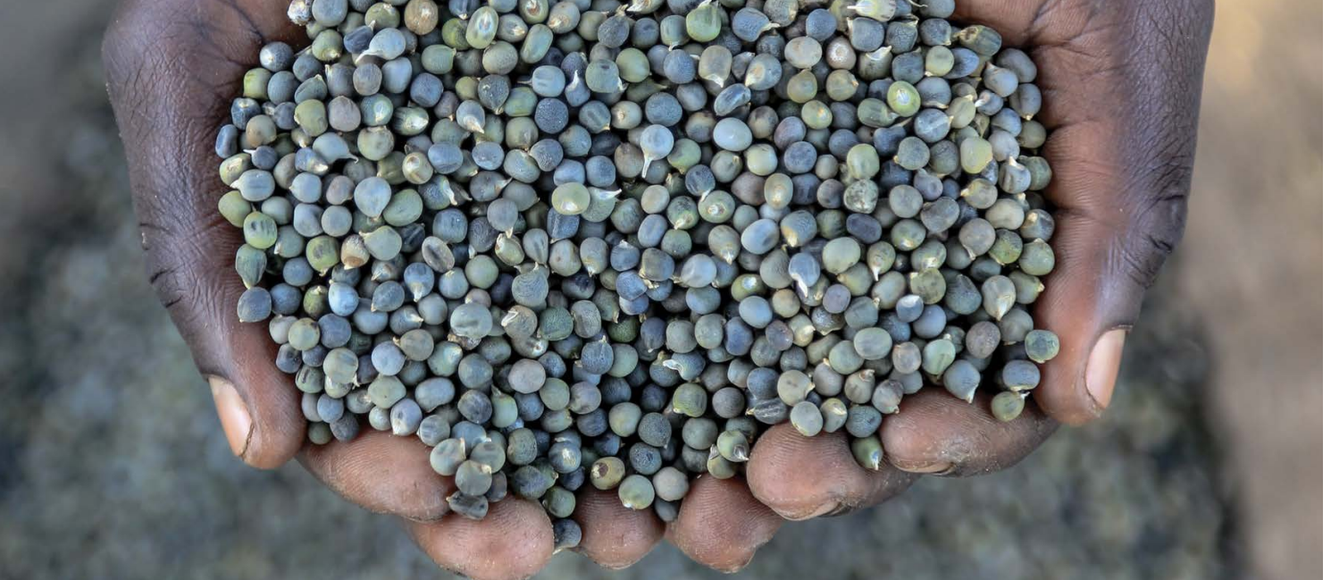
Okra seeds (Joseph Muhumuza)

perceptions are more commonly reported among urban consumers than rural consumers (Kansiime et al., 2018), there is a resurgence in awareness of the health benefits of these indigenous foods amongst the upper and middle classes in urban areas, and there is a gradual increase in demand for these foods in urban settings.