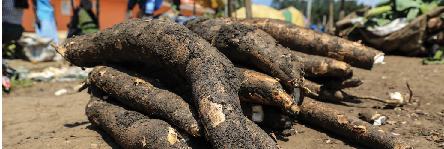
Cassava (Joseph Muhumuza)

The Uganda Nutrition Action Plan (UNAP) (2011-2016) aims to reduce malnutrition levels among women of reproductive age, infants and young children. In its second objective, to “Enhance consumption of diverse diets”, the action plan aims to promote production and consumption of indigenous foods to enhance dietary diversification, and to promote positive indigenous dietary practices. The Action Plan also aims to research, document, and disseminate findings on positive indigenous dietary practices in its strategy to enhance operational research on nutrition. It provides key opportunities for the promotion of consumption of nutritious indigenous foods in Uganda.