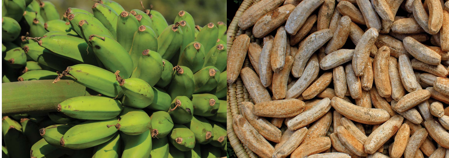
Matooke (left) and Emikakaaro (peeled and dried matooke) (right). Emikakaaro can be kept for a long period and is usually utilised in times of drought