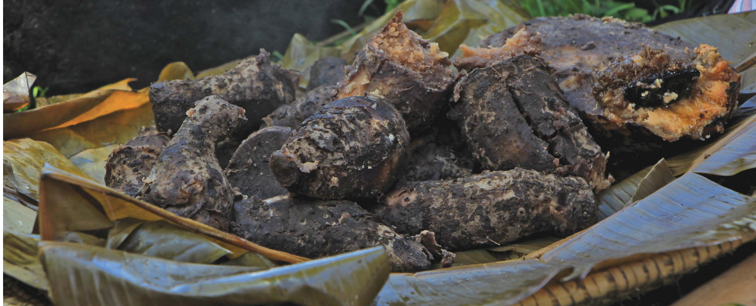
A winnowing basket covered with steamed banana leaves with yams served (Joseph Muhumuza)

Food preparation is a critical component of the day to day activities of a community. Box 1 presents preparation methods for some key local and indigenous foods in Uganda (PELUM Uganda, 2011).