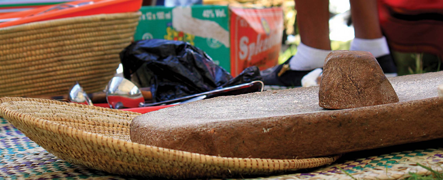
The millet grinding stone used to grind millet for porridge and millet bread (Joseph Muhumuza)

in Uganda is continually being undermined by both natural (e.g climate change) and manmade effects (e.g conflict, fake or poor quality seed on the market, promotion of hybrid seeds that need to be bought each season, and the potential threat posed by genetically modified organisms) (PELUM Uganda, undated).