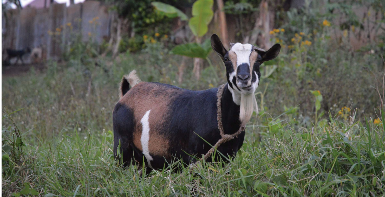
Indigenous goat breed Slow food

Farmers in Nakasongola and Mubende districts agree that there have been several seasonal changes in recent years that can be linked to climate change and variability. The farming households have been able to ensure food and nutrition security in their homes by building granaries to store food reserves; growing food crops that stay in the garden for a long time especially root crops like cassava, sweet potatoes and yams; and setting up kitchen gardens in order to grow diversified foods for household use (PELUM Uganda, 2010).