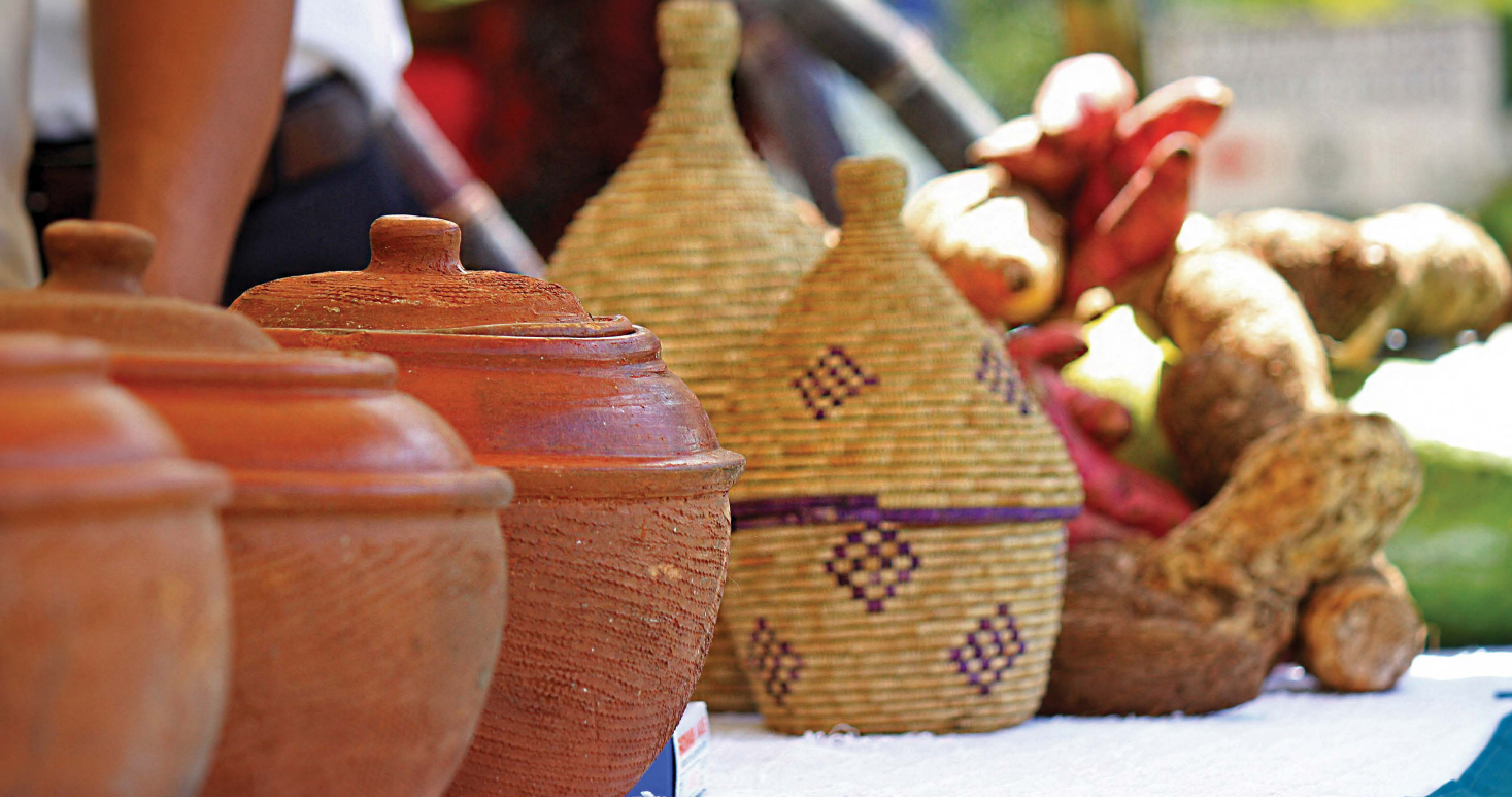
Traditional food is prepared, kept safe, served hot or warm in pots and baskets (Joseph Muhumuza)