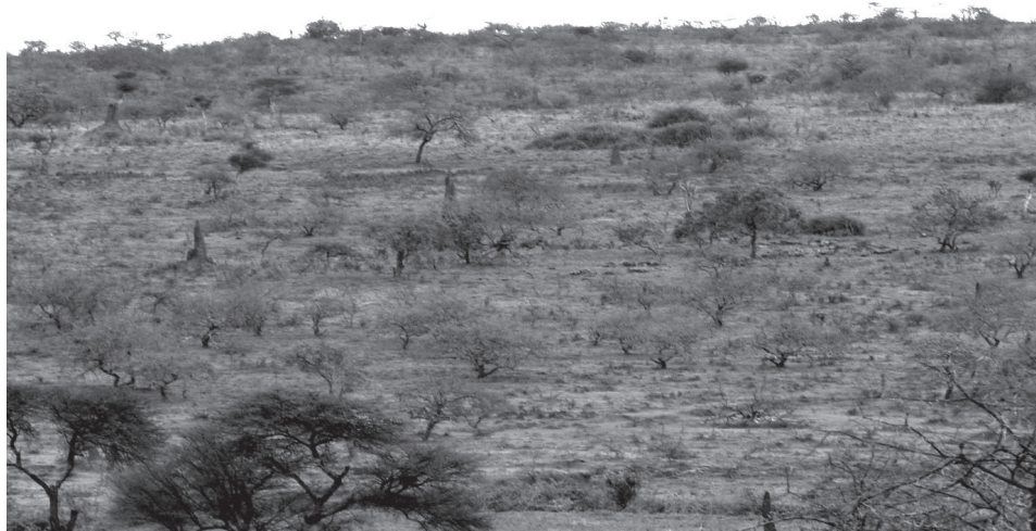
FIGURE 3. LAND DEGRADATION IN THE BORENA RANGELANDS.

Conflict over grazing and watering resources and boundary claims have become a major livelihood challenge for pastoral communities. Some areas, such as in the Wachille and Surupa areas in Borena rangelands, have been abandoned in fear of conflicts, resulting in the underuse of available resources. A solution has to be found for defusing the growing conflict between Karrayu and Argoba , Karrayu and Afar , and between Borana and Guji , Borana and Gari communities. Alternative dispute resolution mechanisms need to be strengthened and customary institutions that regulate access and use of communal resources need to be empowered.