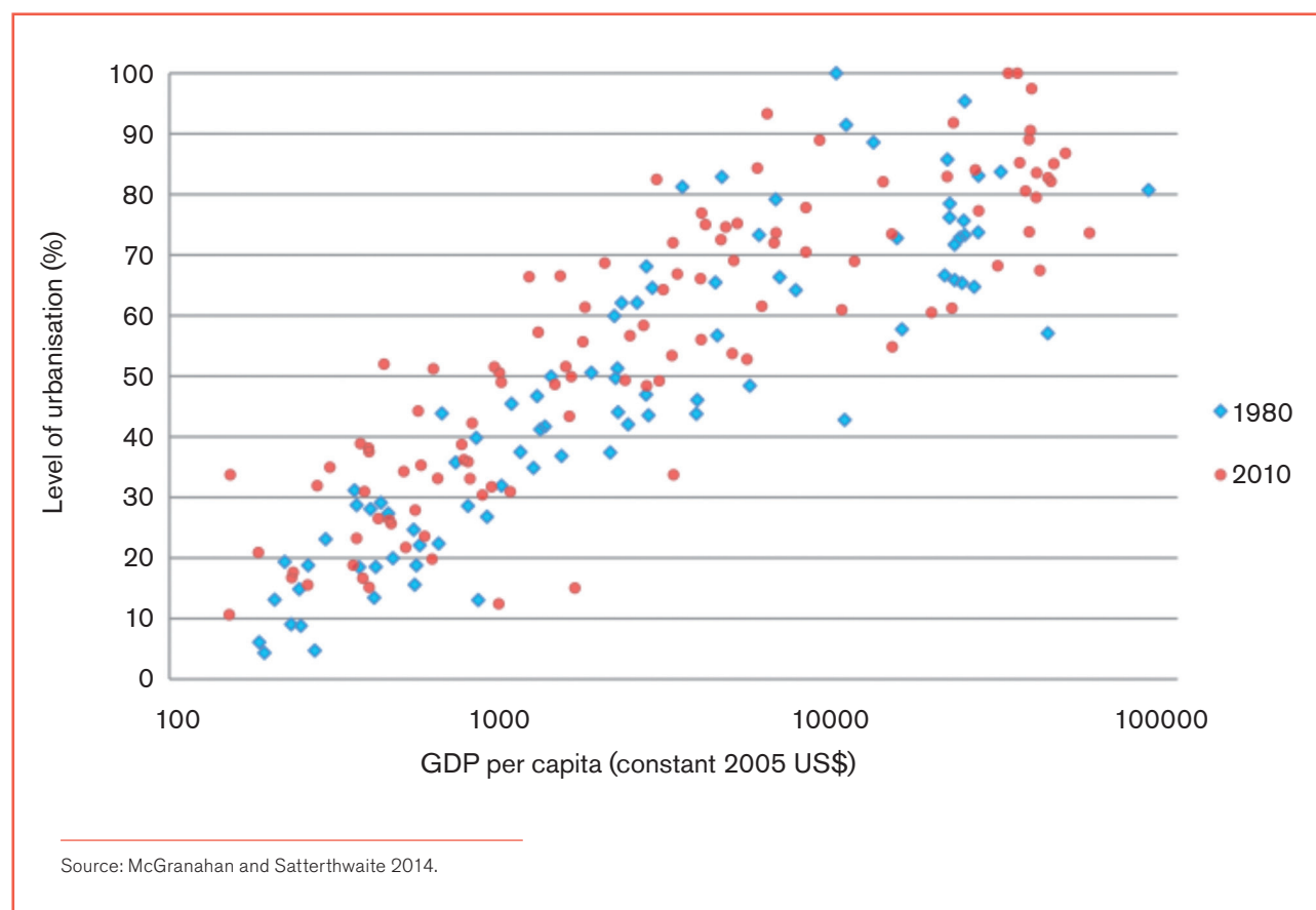
Figure 2. National levels of urbanisation and per capita income, 1980 and 2010

Many of the reasons economists give for why modern trade and production offer an economic advantage to people and enterprises who agglomerate in urban centres revolve around specialisation, the lower per unit costs of large-scale production, and clustering to reduce transport and transaction costs. In a simple account of industrial urbanisation, the shift from agriculture reduces the need for production to be dispersed across the arable landscape, returns to scale create the incentive for individual manufacturers to concentrate their production, and lower transport costs create the incentive for producers and workers to locate near large markets (Krugman 2011; Krugman 1991). For post-industrial economies, the less tangible benefits of agglomeration become more prominent, such as the better opportunities for informal knowledge sharing and networking that larger settlements provide (Storper and Venables 2004). Such benefits are also likely to be present at lower levels of income, but may be hidden by the importance of industry-related incentives to urbanise.