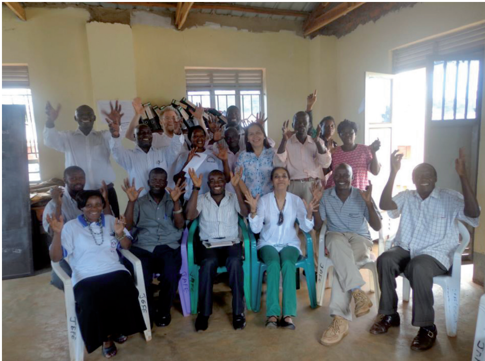
Photo 3: The meeting with federation members

Framework for monitoring CBE. Strategies and systems used by local governments for supporting greater inclusion for low-income groups need to recognise, first, the need for representative community organisations and, second, the need to facilitate these organisations' engagement with the state. For the federations, monitoring this requires monitoring of three phases of development within which many milestones can be set: