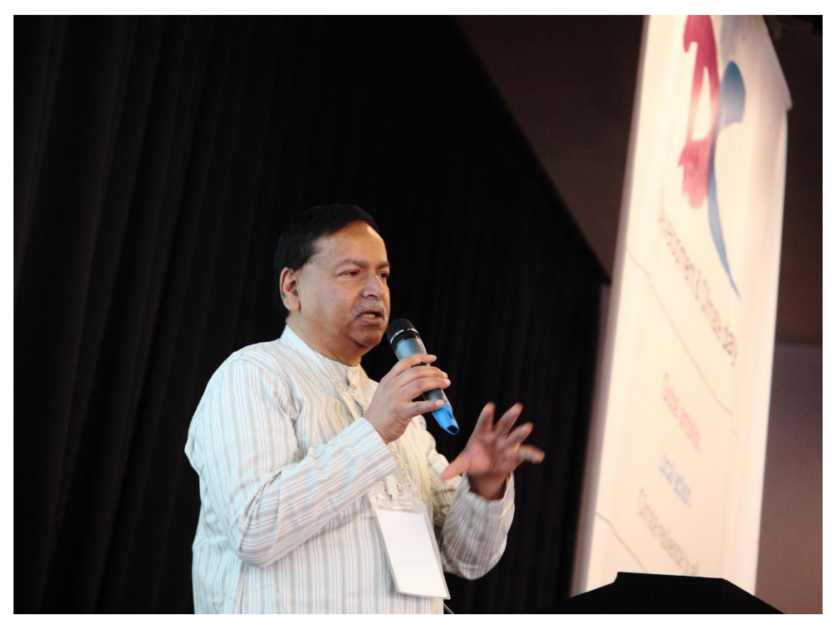
Saleemul Huq speaking at D&C Days Marrakech in 2016

Notably, these themes represent much more of a formal packaging of recurrent themes and commitments within previous D&C Days than new agenda items. The following sections discuss these and other key themes and trends across D&C Days in more depth.