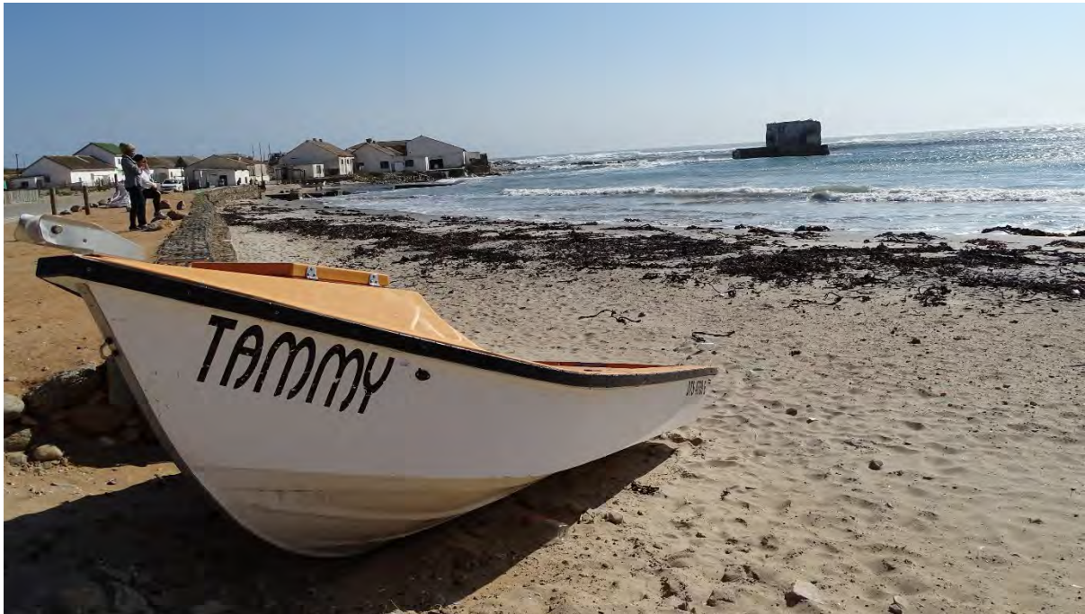
Figure 3 Fishers and their boats – safety is important to ensure they can continue fishing for their families