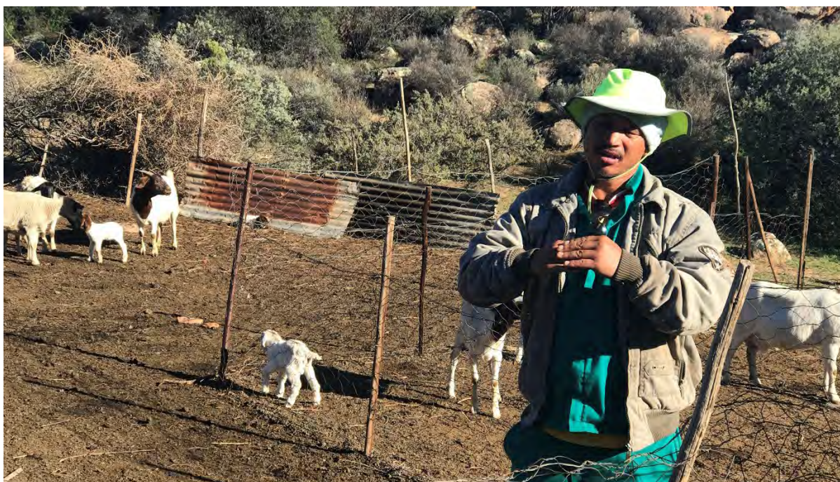
Figure 7 A Gondwana Alive monitor explaining during a learning exchange the benefits of the climate smart breeds

She says the climate change training and the animal health training could definitely be done with the rest of her community. The training helped her. She says, “It was not difficult for me to implement the proposed activities, as we received training in it, and therefore I knew what to do.”