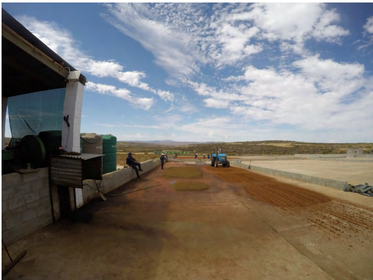
Figure 8 Heiveld cooperative processing rooibos tea at the tea court