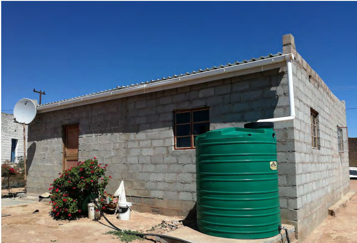
Figure 6 A newly installed watertank and gutters in Soebatsfontein (EMG)