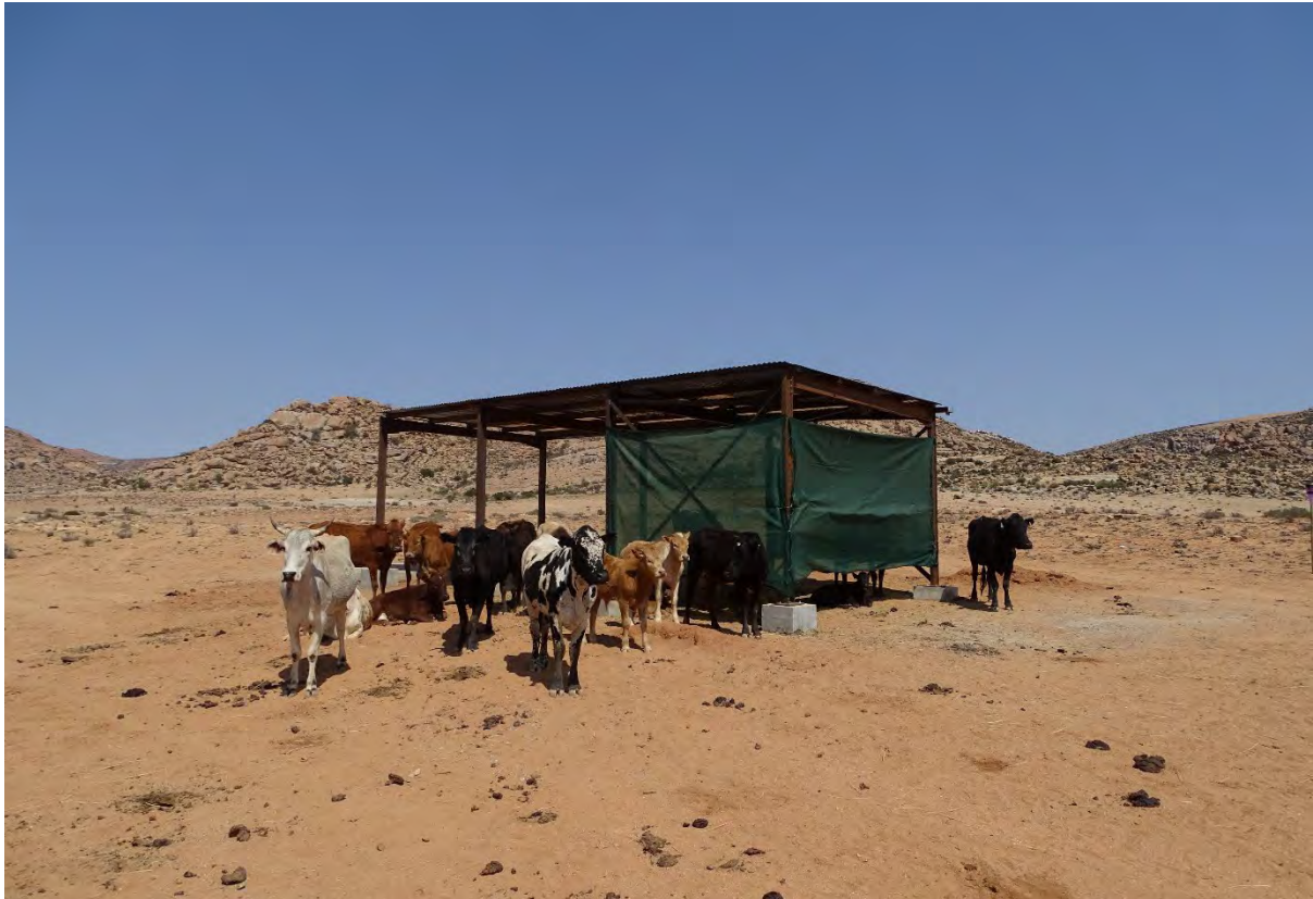
Figure 11 Livestock using one of the CLB shelters Challenges: A Summary of Lessons from challenges