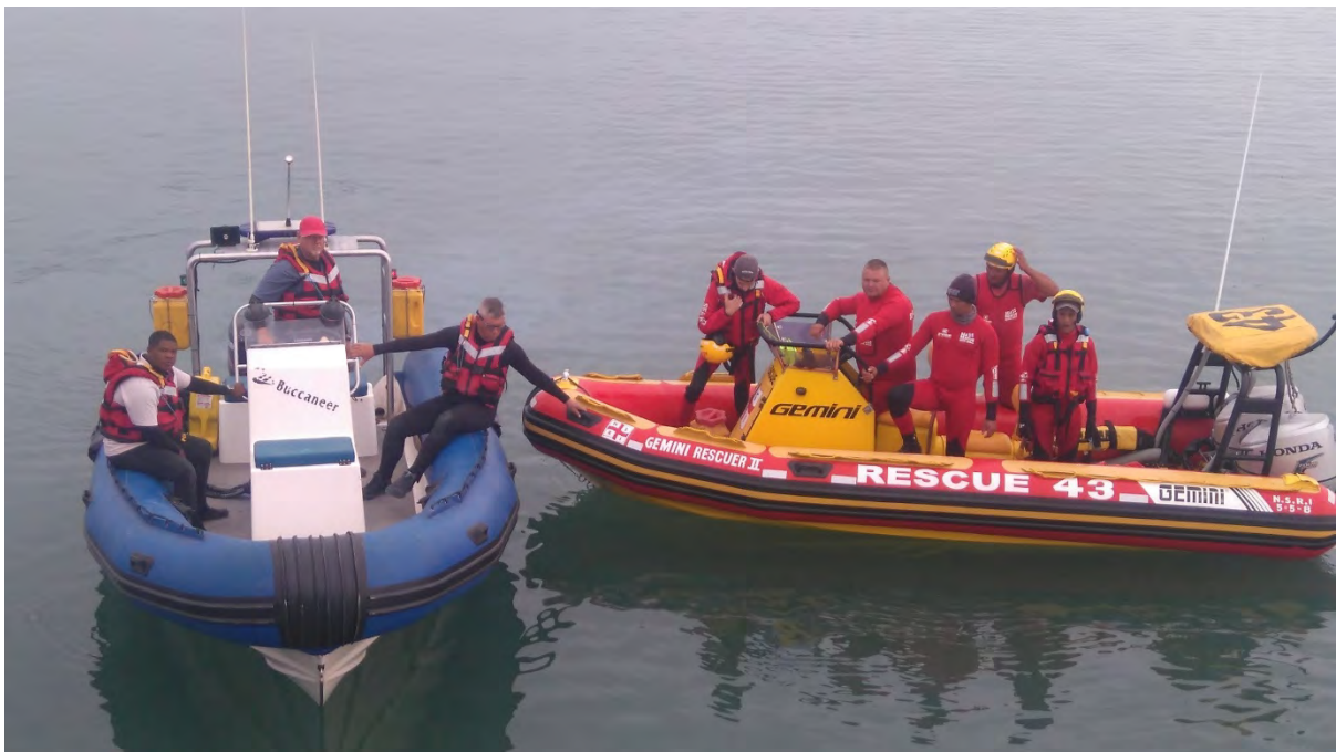
Figure 4 Small-scale fishers undergoing 'safety at sea' training.