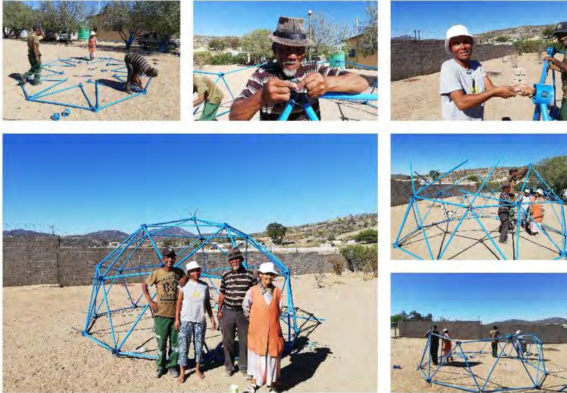
Figure 2 KHF putting the dome prototype together