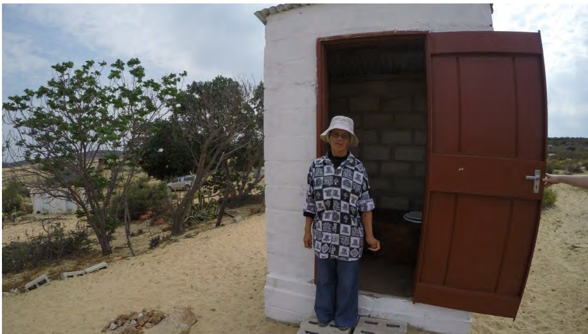
Figure 5 A beneficiary in Suid Bokkeveld with her composting toilet