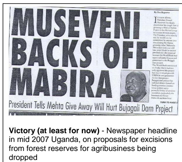
Victory (at least for now) - Newspaper headline in mid 2007 Uganda, on proposals for excisions from forest reserves for agribusiness being dropped

Observers talk of the emergence of a green consciousness and of these forestry issues getting to the heart of the governance problem in Uganda – the widespread reaction to them is certainly one of the most emotive issues in President Museveni's 21-year rule. Many have also noted the effect that surging interest in biofuels is having. International palm oil and sugar prices are rising as demand for the fuels made from these commodities kicks in. These price attractions are likely to be influencing Museveni's decisions at Mabira and Bugala, and what is happening in Uganda seems to be the shape of things to come. However, for now at least the forest governance information and advocacy work has paid off – both the Mabira and Bugala plans are officially on hold.