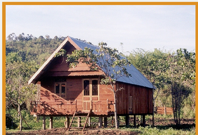
Timber for a new house like this will still be an important incentive for local people

External support may play an important role in the management of community forests, particularly in the villages with official CFM arrangements. In Dak Lak and Thua Thien Hue, communities were more inclined to engage in forest management and derived greater benefits from local forest resources when government agencies and other external service providers adequately addressed their support needs (see example in Box 3). In contrast, when there is little or no external support, it is difficult for local people to realize their rights to local resources and thus, they become forest owners on paper only.