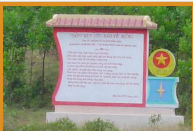
Rules set in stone - in an official CFM village

In contrast, local people in the two villages practicing traditional CFM have developed their own forest protection regulations without any external intervention