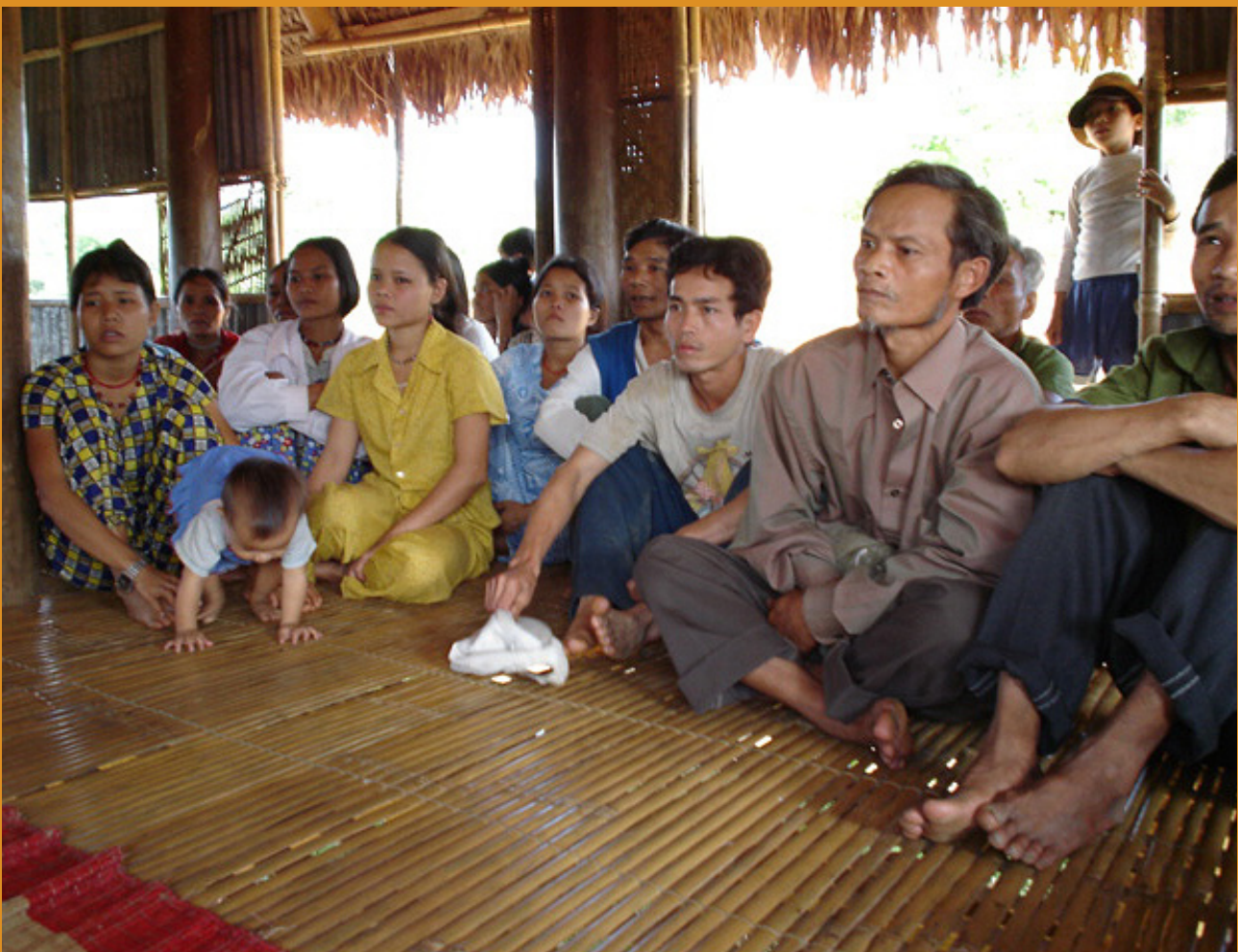
Local people in a discussion with FGLG members in Thua Thien Hue province