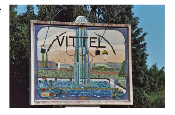
Figure 2: Vittel – a reputation based on an enduring image of health and vitality

Vittel waters are characterised by a total absence of nitrites and a particularly low level of nitrates. To be labelled 'Vittel', the water cannot contain more than 4.5 mg of nitrates per litre and must not contain pesticides. In comparison, the maximum nitrate rate in France is 15 and 50mg/l for mineral and tap water respectively. French legislation dictates that, if mineral concentration changes, the right to use the 'natural mineral water' label (and therefore the business associated with the brand name) is lost. How to ensure this stability varies from country to country.