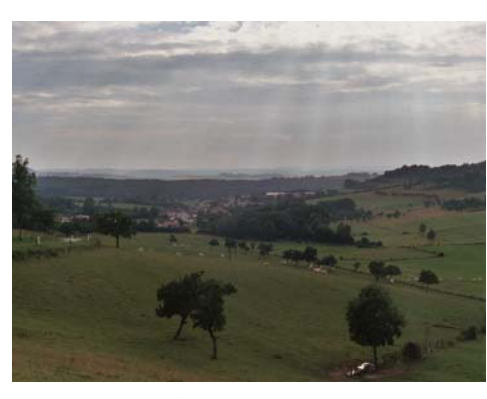
Figure 3: Farming landscape in Vittel catchment after the programme was implemented

The programme was ultimately successful. By 2004, all 26 farms in the area had adopted the new farming system; 1,700 ha of maize had been eliminated; and 92% of the sub-basin was protected. The programme speeded up the retirement of the marginal farmers (groups A and B) who sold their land to Agrivair. The number of farms in the sub-basin declined from 37 to 26 while