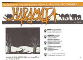
Haramata no 1, July 1988