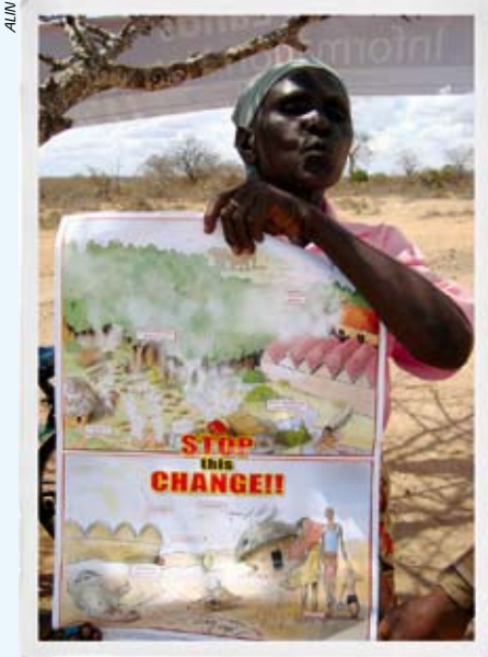
A woman displaying a poster with climate change messages at Malili village

adds that water has turned saline. The reason behind this change is unknown but many think that this is due to high levels of pollution and to sand harvesting which exposes saline rock increasing water salinity. "Sand harvesting has led to a reduction in the water levels in rivers and to dry river banks. Because people are poor they are turning to any available