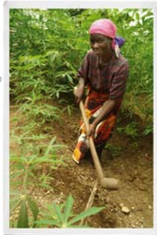
Farmer weeding a cassava field in Neno district, Malawi