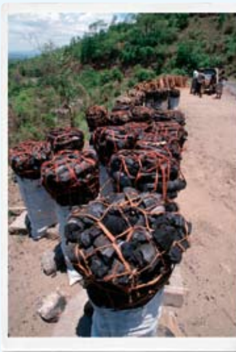
Sacks of charcoal and fuelwood for sale at roadside in south Malawi

The conventional view of biomass is that it is an unsustainable and polluting ‘traditional’ fuel that must be replaced by ‘modern’ energy, such as fossil fuel-based electricity, if rapid development is to occur. But calculations reveal that there is more than sufficient biomass, not only to maintain present consumption, but also to expand its use considerably. A principal cause of global warming is the increased use of fossil fuels. And the recent dramatic price rises in fossil