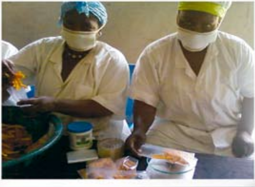
Weighing dried mangoes

vulnerable and uncertain, especially when compared to those of men. In Mali, customary inheritance laws and, specifically the laws which govern the allocation of land favour men, despite women's important role in ensuring food sovereignty.