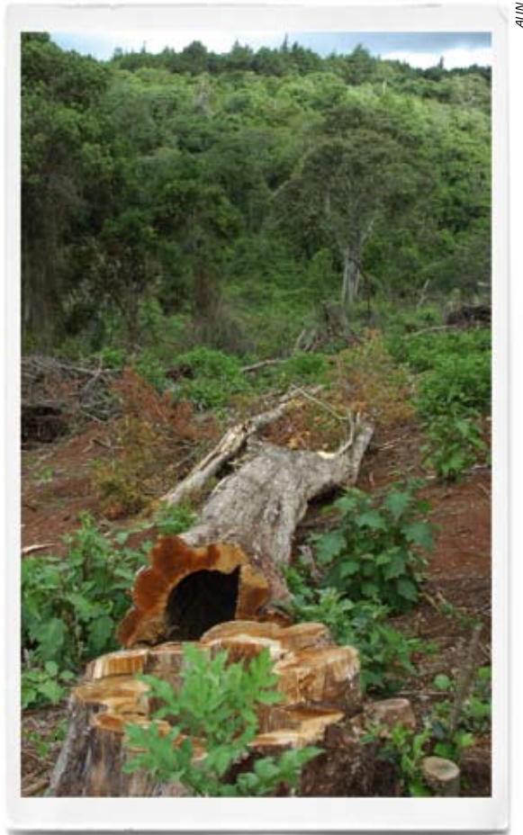
Tree clearing in Mau forest

In these new settlements, the Ogiek community, a minority group who have been living in the forest for centuries, were to be given first priority in the allocation process. The purpose was to ensure that they too were proud land owners. Although they had shown no desire to own land, a former government administration thought